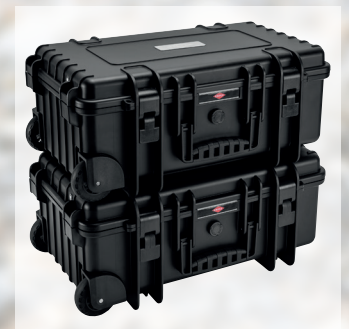
Perfect for teams too: several tool cases stack together.