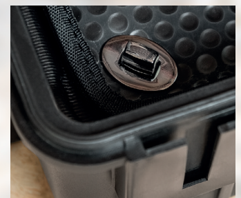
Secure fixing of the tool board prevents tools from falling out of the base.