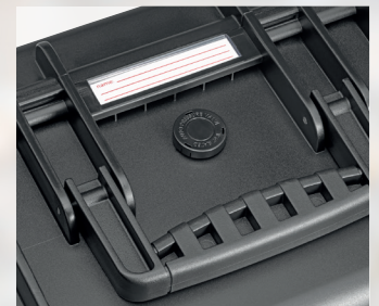
Pressure valve for ventilation and nameplate for individual identification.