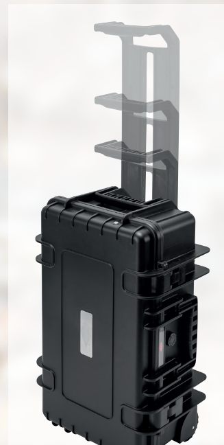
The telescopic handle turns the case into a trolley: simply pull the heaviest tools!